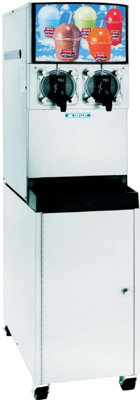
Shown with optional syrup storage cart

Preventative maintenance programs are available through your local Taylor distributor.